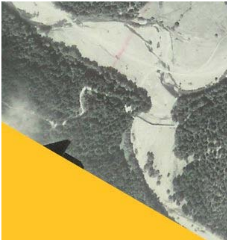
09/22/52 0 ' Up Wheatfield Dir 0 Cr Station 0 LWD Site 0 12:00 PM Photo 4012 Road# 40 Mi. 1.6 Map Pt. 2450 THP Maintenance The South Fork is dry but seems to cross over to the right bank where the new bridge is now.