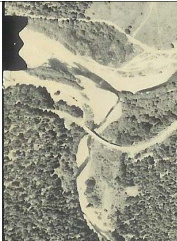
06/08/94 0 ' Up Wheatfield Dir 0 Cr Station 0 LWD Site 0 12:00 PM Photo 4021 Road# 40 Mi. 1.6 Map Pt. 2450 THP Maintenance The South Fork is in the center of the channel.