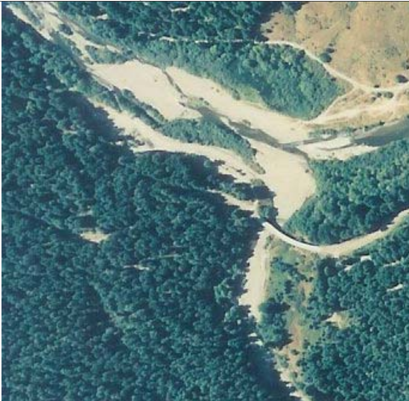
07/17/98 0 ' Up Wheatfield Dir 0 Cr Station 0 LWD Site 0 12:00 PM Photo 4016 Road# 40 Mi. 1.6 Map Pt. 2450 THP Maintenance The South Fork is on the right bank.