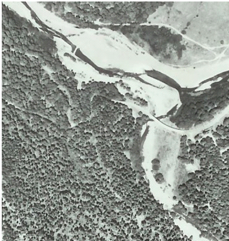
06/26/84 0 ' Up Wheatfield Dir 0 Cr Station 0 LWD Site 0 12:00 PM Photo 4019 Road# 40 Mi. 1.6 Map Pt. 2450 THP Maintenance The South Fork crosses over to the right bank under the new bridge.