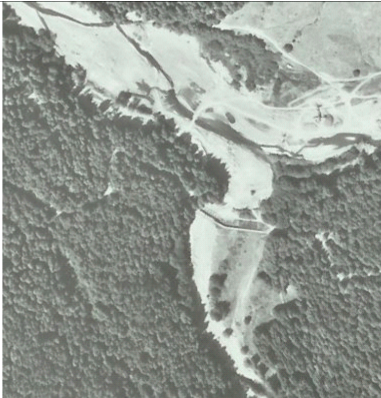
09/15/71 0 ' Up Wheatfield Dir 0 Cr Station 0 LWD Site 0 12:00 PM Photo 4013 Road# 40 Mi. 1.6 Map Pt. 2450 THP Maintenance The South Fork seems to cross over to the right bank where the new bridge is now.