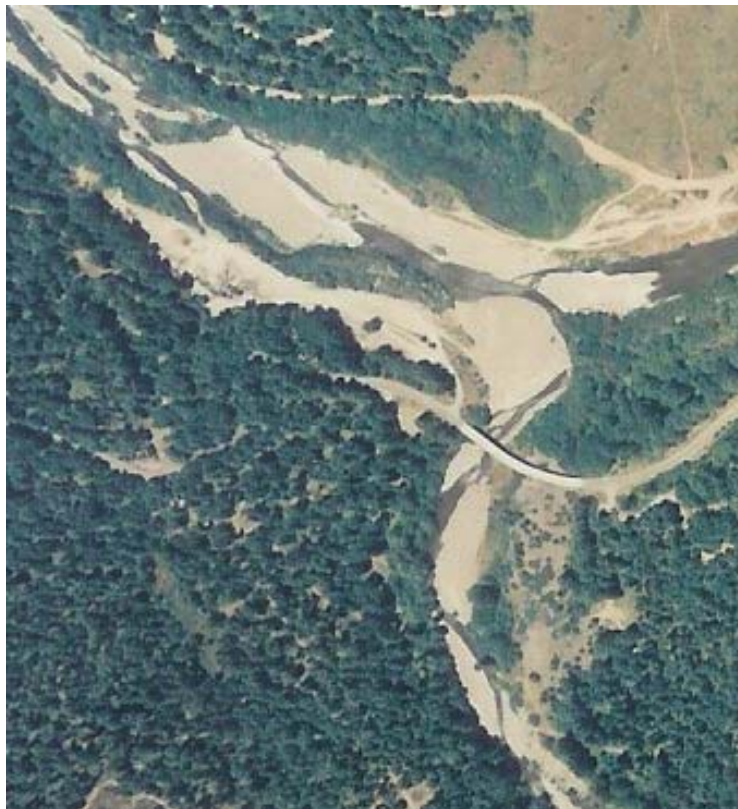
07/01/96 0 ' Up Wheatfield Dir 0 Cr Station 0 LWD Site 0 12:00 PM Photo 4017 Road# 40 Mi. 1.6 Map Pt. 2450 THP Maintenance The South Fork is on the right side but not up against the bank.