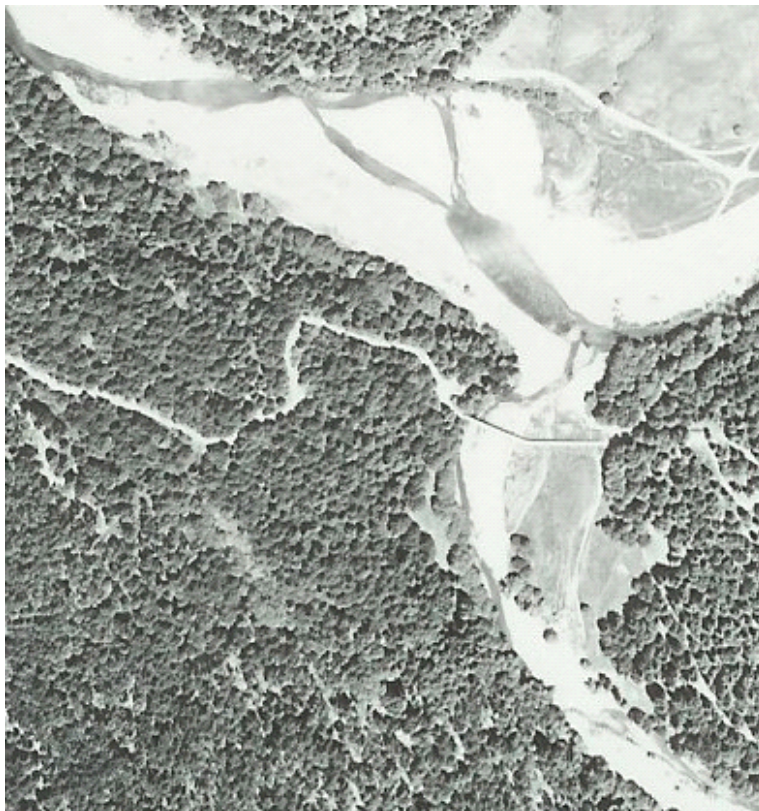
05/04/59 0 ' Up Wheatfield Dir 0 Cr Station 0 LWD Site 0 12:00 PM Photo 4022 Road# 40 Mi. 1.6 Map Pt. 2450 THP Maintenance The South Fork is in the center of the channel.