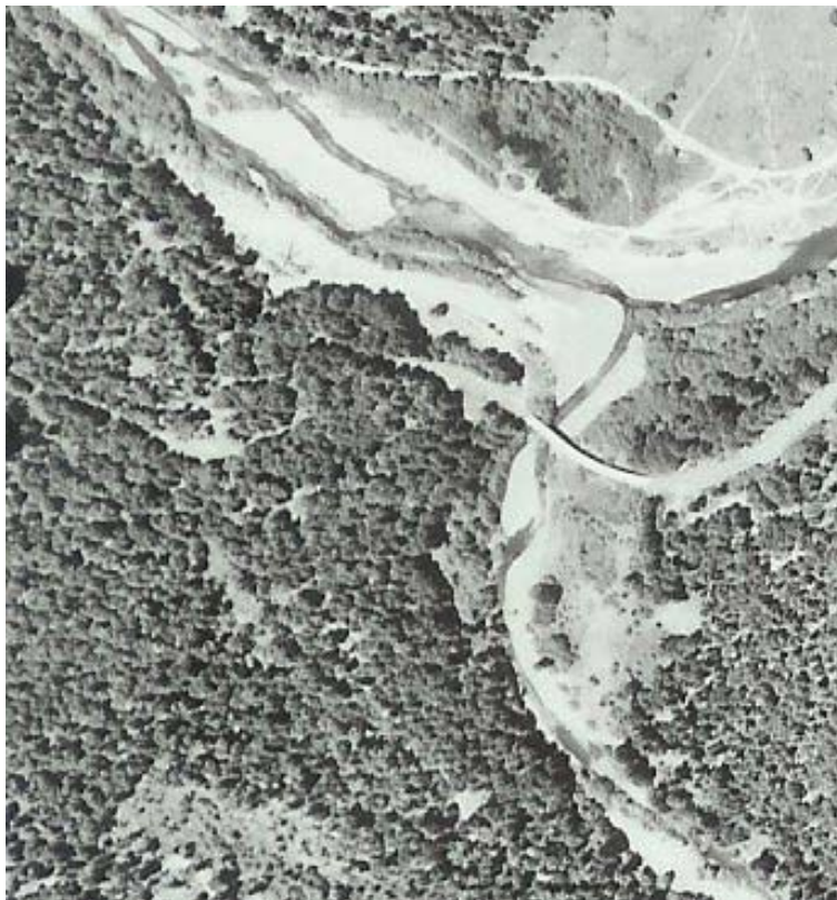
06/26/93 0 ' Up Wheatfield Dir 0 Cr Station 0 LWD Site 0 12:00 PM Photo 4018 Road# 40 Mi. 1.6 Map Pt. 2450 THP Maintenance The South Fork is in the center of the channel.