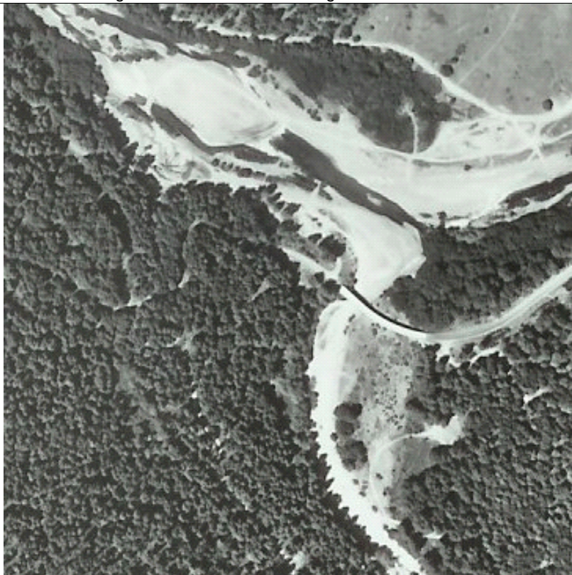
08/16/88 0 ' Up Wheatfield Dir 0 Cr Station 0 LWD Site 0 12:00 PM Photo 4015 Road# 40 Mi. 1.6 Map Pt. 2450 THP Maintenance The South Fork crosses over to the right bank under the new bridge. It seems dry.